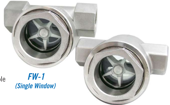
FW-1 (Single Window)

Size: 1/4", 3/8", 1/2", 3/4", 1", 1 1/4", 1 1/2", 2" NPT or PF Female available